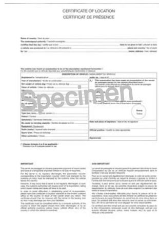
Certificate of Location