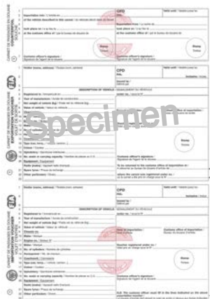
Inside page (25)