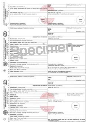
Inside page (25)